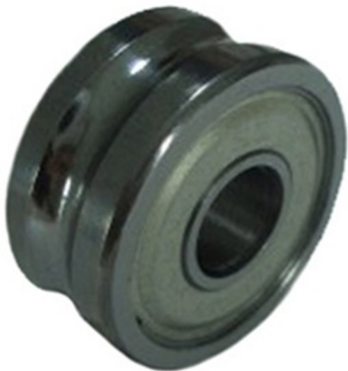
Bearing 2D drawings and 3D CAD models